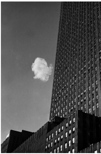
Lost Cloud, New York, 1937