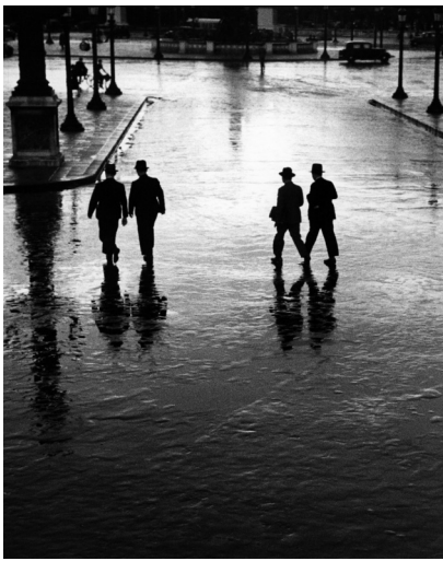
Place de la Concorde, Paris, 1928