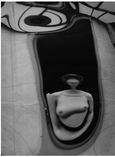
Distorsion no. 200, 1933