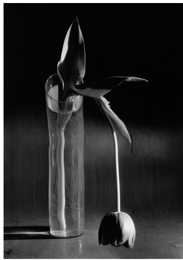
Melancholic Tulip, New York, 1939