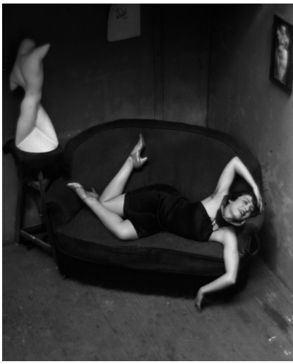
Satiric Dancer, 1926 Bibliothèque nationale de France