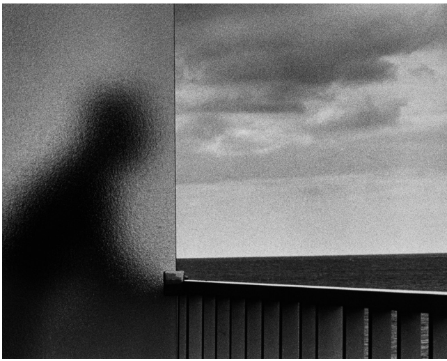
Martinique, January 1, 1972