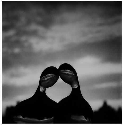
July 3, 1979