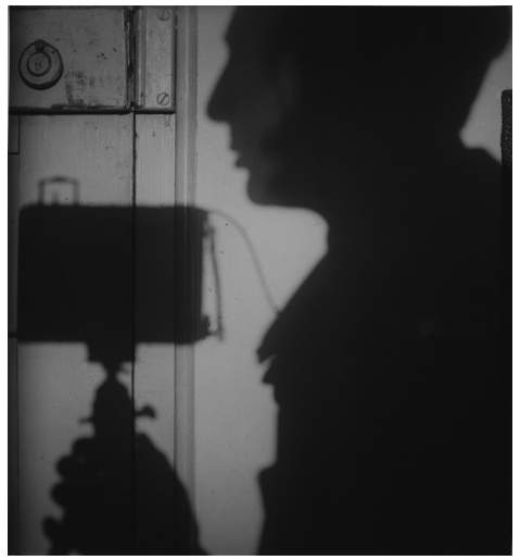
Self-Portrait, Paris, 1927